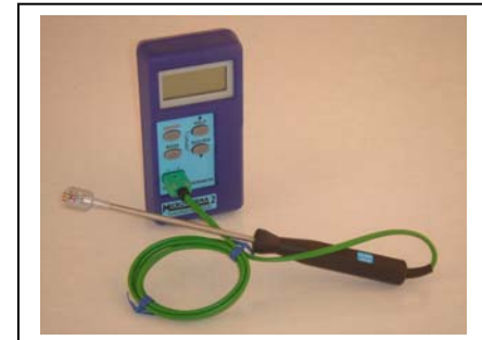
Thermometer and s/s band surface probe to check jaw temperatures.